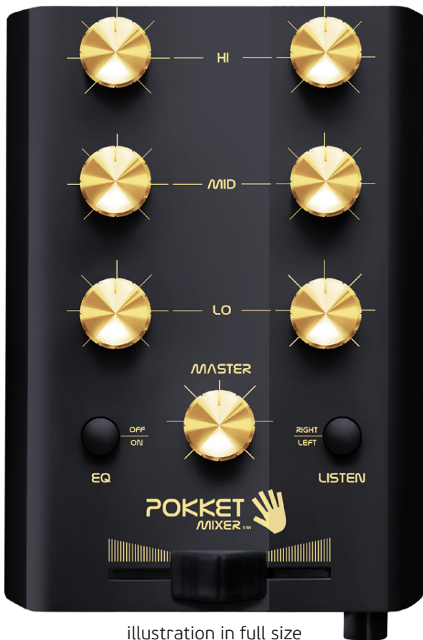
illustration in full size

The electronic circuitry that enables a DJ mixer console is solved innovatively and passively with the unique POKKETMIXER design – no power supply is needed!